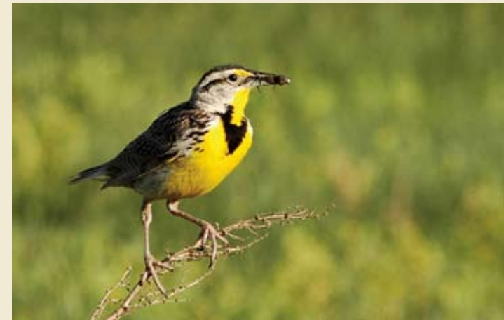
Western Meadowlark.