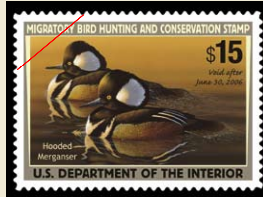
U.S. Fish and Wildlife Service

Protect your cat from injuries and diseases while preventing the deaths of wild songbirds by keeping it indoors or on a leash.